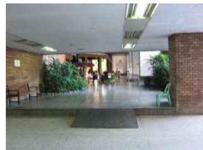
Hotel Side Entrance