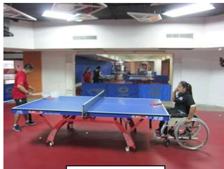
Tables 6 to 8

Call Area: Located just outside the Competition Hall, the large space available made it comfortable for the wheelchair teams to access the CA tables as well as to assemble for the presentation.