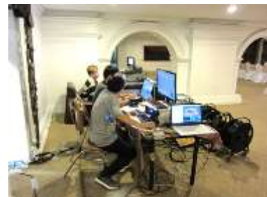
The Broadcast Team