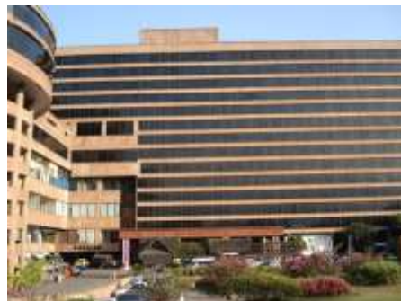
Front of Hotel & Part of Venue

Accessibility within the hotel was good, except for the bathrooms.