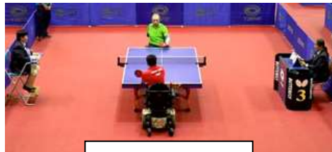
Screen Grabs: Tables #3 & #4

There was live streaming everyday via YouTube. At times 2 tables were streamed and at times only one. This effort to have live streaming is a move in the right direction and was appreciated by many.