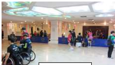
Tables 1 & 2

With the exception of Practice Tables 1 & 2, where the lighting was approximately 400 lux, the lighting for the other 6 tables was too low at approximately 250~300 lux. The players did find the poor lighting a disadvantage when carrying out training or warming up prior to their matches.