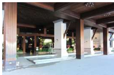
Hotel Front Entrance